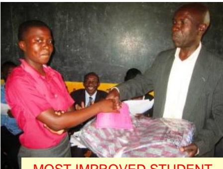
MOST IMPROVED STUDENT FORM 4, BELVINE, RECEIVING A BLANKET