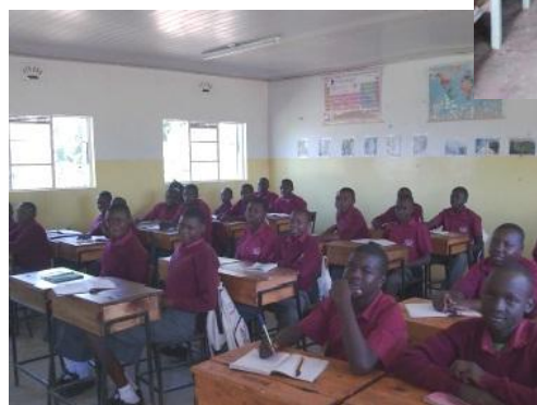
Over 10 years: Collecting over 50 trophies along the way and moving from 6th to 3rd position in the County in 2017 out of 152 schools.